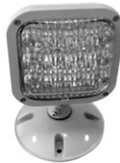
Single Lamp with Weatherproof (WP) Option