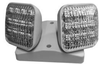
Double Lamp with No Options